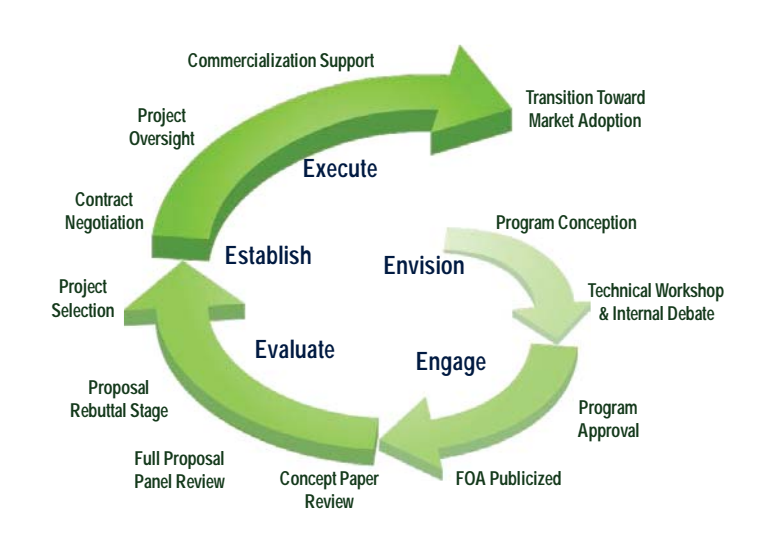
Figure 2: ARPA-E Technology Acceleration Approach

ARPA-E exists to aid the development and accelerate the deployment of transformational and disruptive energy technologies—technologies that hold the potential to radically shift the nation's energy sector. ARPA-E selects potential investment areas by considering the science and technology landscape, the market landscape, and the regulatory landscape. ARPA-E will invest in technology development only in instances where circumstances in each of these areas are aligned to enable transformative, breakthrough discoveries that have the potential to then be brought to market scale. ARPA-E programs are created through a detailed process that begins with a thorough vetting of a particular technology concept. Figure 2 shows the full life cycle of an ARPA-E program (Envision, Engage, Evaluate, Establish, and Execute) from program conception through transition toward market adoption (See Figure).